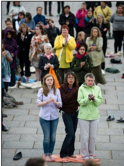
KAIROS Mass Blanket Exercise, held on Parliament Hill, June 2015.

KAIROS & Legacy of Hope networks mobilize to advance full implementation of Indigenous history and culture in public schools