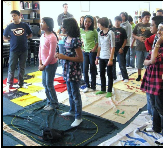
KAIROS Blanket Exercise.