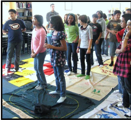
KAIROS Blanket Exercise.