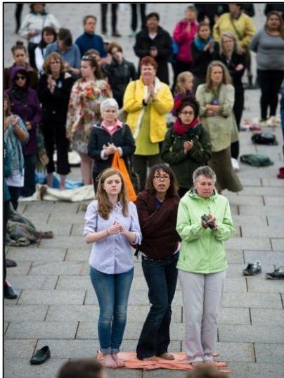
KAIROS Mass Blanket Exercise, held on Parliament Hill, June 2015.

KAIROS & Legacy of Hope networks mobilize to advance full implementation of Indigenous history and culture in public schools